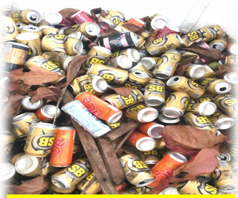
These empty beer canes and others have been taken out of the beach by myself and school children. It is a scene one will not miss if there is a logging company nearby or in the village.

such in turn affect our health, our for- of damage to the ecosystem on the weather conditions