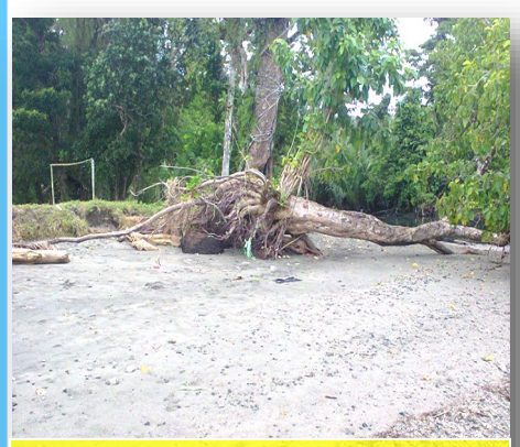
This tree was standing upright when I first arrived at Voruvoru village four years ago. This and others have fallen down. Notice that the soccer oval will be under water soon.

Those of us, the laity, who make up the have tropical rains and hot atmosphere. majority of the world's population, are Humidity in our atmosphere is almost not scientists. In fact, scientists are very 100%, but in other countries that is few. If that is the case, it may be difficult simply not the case. In my humble view for us to discuss, if any, a scientific expla- that is what is referred to as prevailing nation of what climate change might weather conditions in an area. mean. On the contrary, we can give a simple explanation from our experience. To do that the question for us as lay people, I propose we have to first of all understand what climate stands for. We can begin from what a simple dictionary has for us. Take for instance, the Oxford English Dictionary would simply define climate as "... prevailing weather conditions of an area ..." (1992:210). This is simple enough for us to carry on.